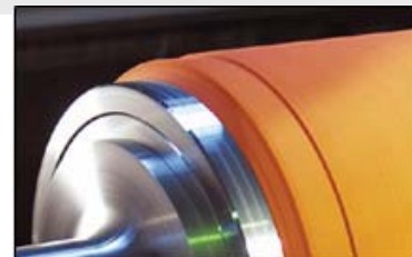
FKM Rollers with Viledon™ Nonwoven Coatings

Contact us for more information, or to discuss the specific requirements of your application.