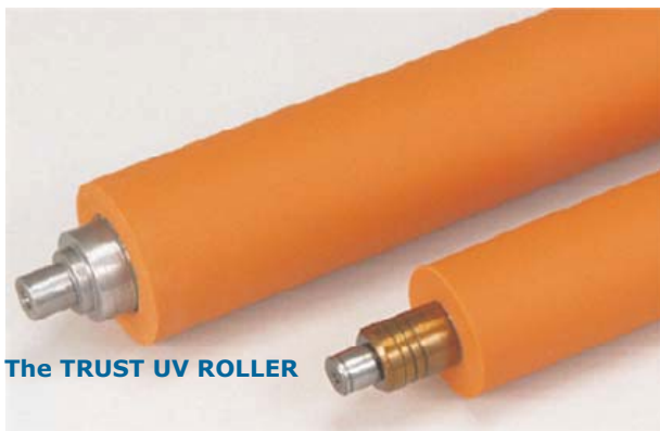
The TRUST UV ROLLER

The newest UV roller technology is now available in North America